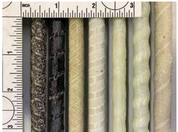
Fig. 1: FRP bar examples with various surface characteristics

The evaluation of FRP bars and meshes used as primary or secondary concrete reinforcement in compliance with the legally adopted building codes in the United States is the topic of this article.