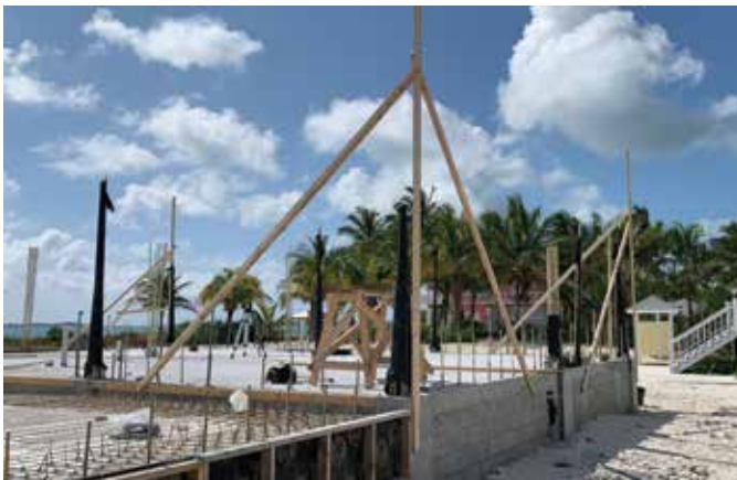
Fig. 3: A coastal residence under construction. The concrete slabs, concrete columns, and masonry walls included FRP reinforcement

The more permanent option would be to revise IBC and IRC to allow alternative materials or assemblies, such as FRP bars and meshes to be used as structural and secondary reinforcement; however, such revisions must go through the lengthy, public comment and approval process of the