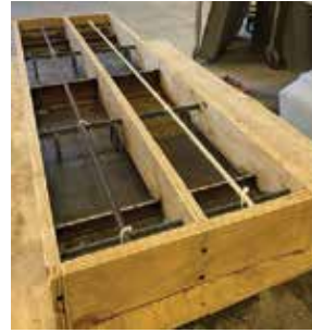
Fig. 6: Formwork, reinforcing bars, and crack initiator for shrinkage cracking test specimen preparation

AC521 applies to glass or basalt FRP bars in cut lengths or meshes produced with solid wires with continuous, uninterrupted circular cross sections. Items evaluated under AC521 include physical and mechanical properties. FRP bars and meshes evaluated under the AC521 are used as alternatives to the shrinkage and temperature reinforcement specified in Section 24.4 of ACI 318-19 for plain concrete footings and for plain concrete slabs-on-ground (as defined by ACI 360R-10 10 ). However, this AC does not eliminate the requirement for joints specified in Section 14.3.4 of ACI 318-19 (and thus IBC and IRC). FRP bars and meshes under this AC are also used as an alternative to horizontal temperature and shrinkage reinforcement in structural plain concrete walls covered in IBC Section 1906, IRC Sections R404.1.3 and R608.1, and ACI 332-14, Sections 8.2.1 and 8.2.7, 11 excluding walls where vertical reinforcement is required. AC521 also provides provisions for shrinkage cracking testing (Fig. 6). The purpose of the shrinkage cracking test is to demonstrate equivalency between a given FRP bar or mesh configuration (that is, FRP cross section size and spacing) and a selected