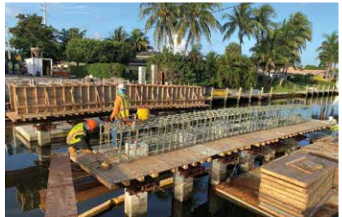
Fig. 4: A coastal bridge under construction. The piers and bent cap were reinforced with FRP reinforcing bars supplied in both straight and pre-bent forms