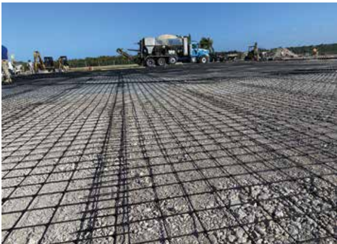
Fig. 5: FRP meshes can be used as secondary reinforcement in slabs-on-ground